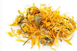
Dried Herbs used in teas, tinctures and topically