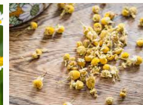
Dried herbs used in teas, tinctures and topically